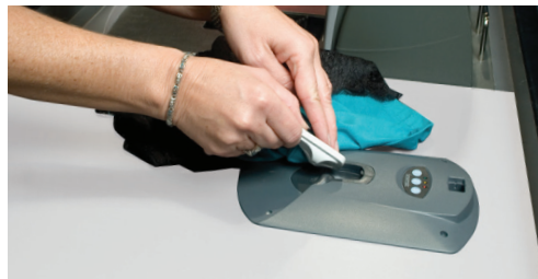
SuperTag Power Detacher