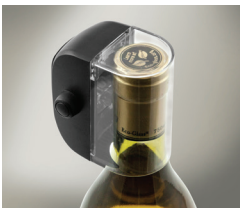
Bottle Cap Tag